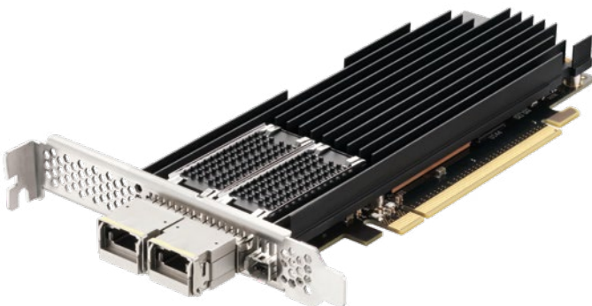
Network Interface Card NT200B01

Napatech helps companies to reimagine their business, by bringing hyper-scale computing benefits to IT organizations of every size. We enhance open and standard virtualized servers to boost innovation and release valuable computing resources that improve services and increase revenue. Our Reconfigurable Computing Platform™ is based on a broad set of FPGA software for leading IT compute, network and security applications that are supported on a wide array of FPGA hardware designs.