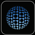
Link™ Capture Software