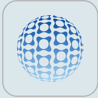
Link™ Capture Software